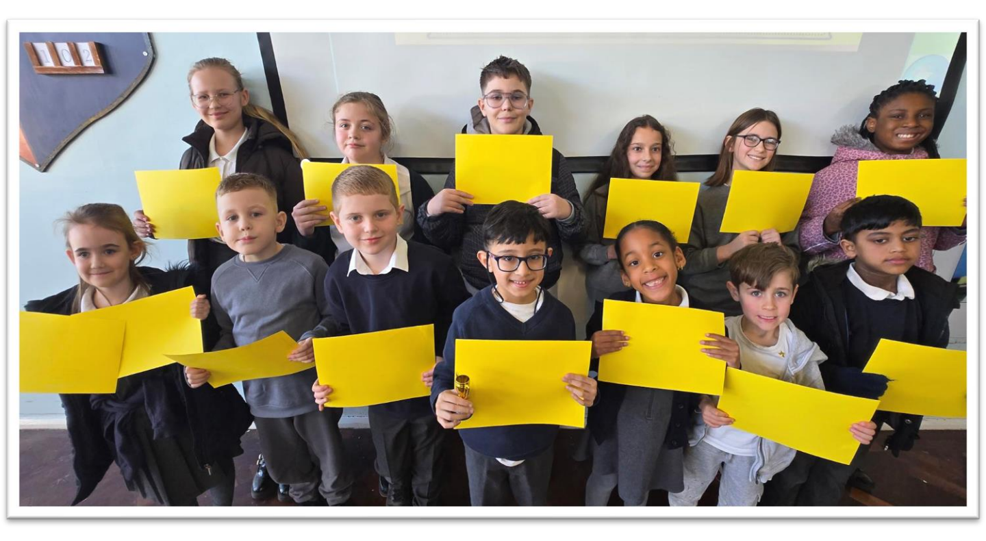
Week 6: I know that my actions affect other people and can make them feel better or worse