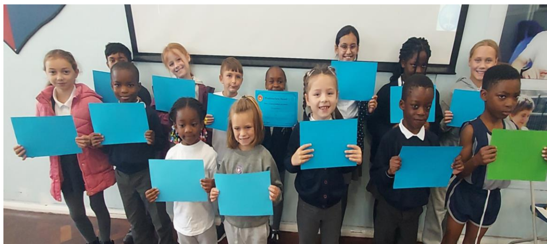
Week 3: Accepting feedback and criticism