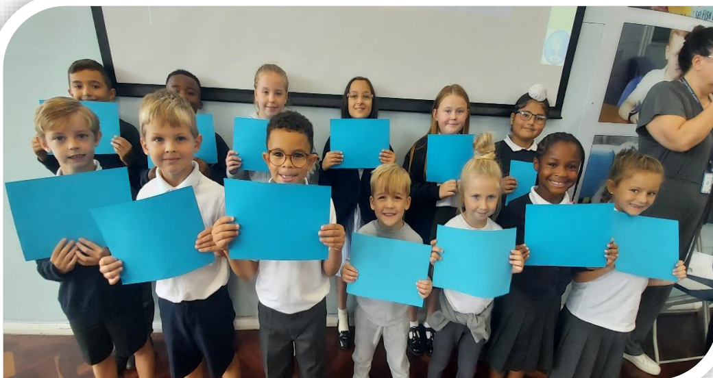
Week 2: Learning from mistakes