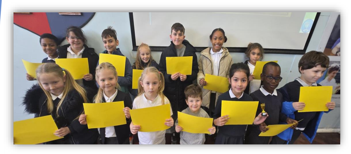
Week 2: I can identify, recognise and express a range of feelings