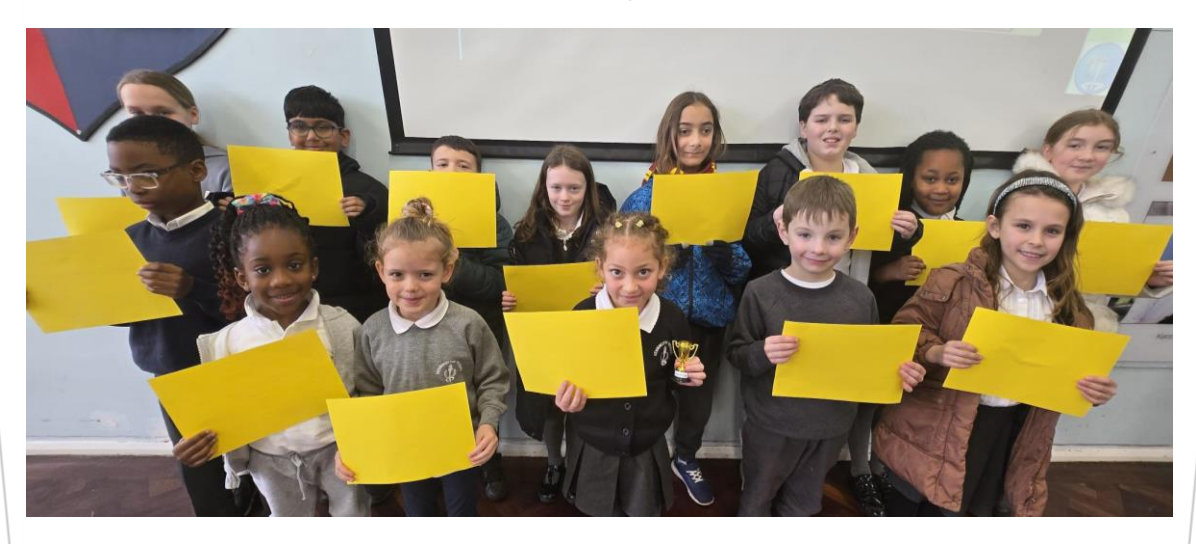
Week 3: I have a range of strategies for managing my worries and other uncomfortable feelings